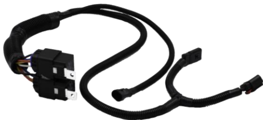
GMC & CHEVY